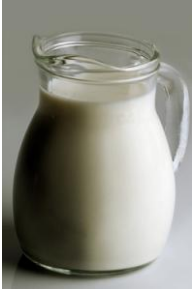
Milk and dairy products.